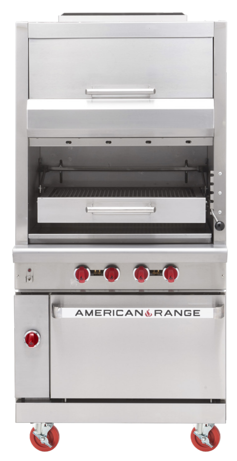
Model AGBU-WO-4 (shown with optional casters)